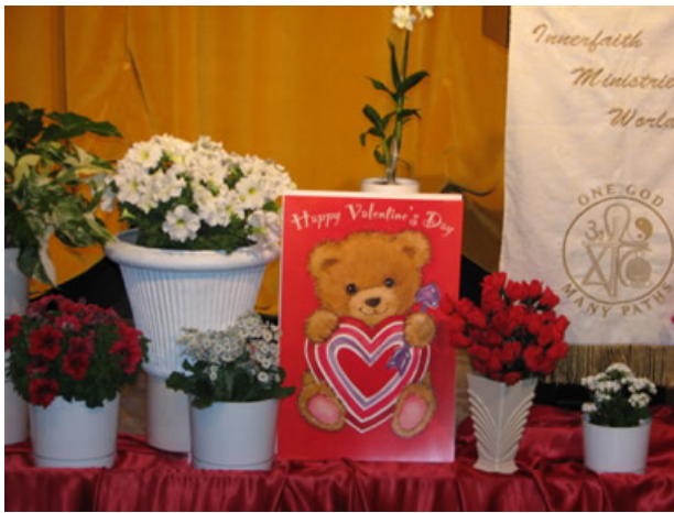
Valentine's Day Stage