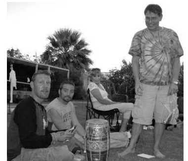
The event was held at the Paul Newman Center with a potluck held afterwards in the Center's Community Hall.