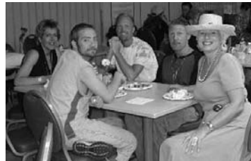
Fall Solstice Celebration