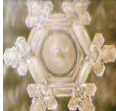
Love and Appreciation

waters were then frozen and photographed.